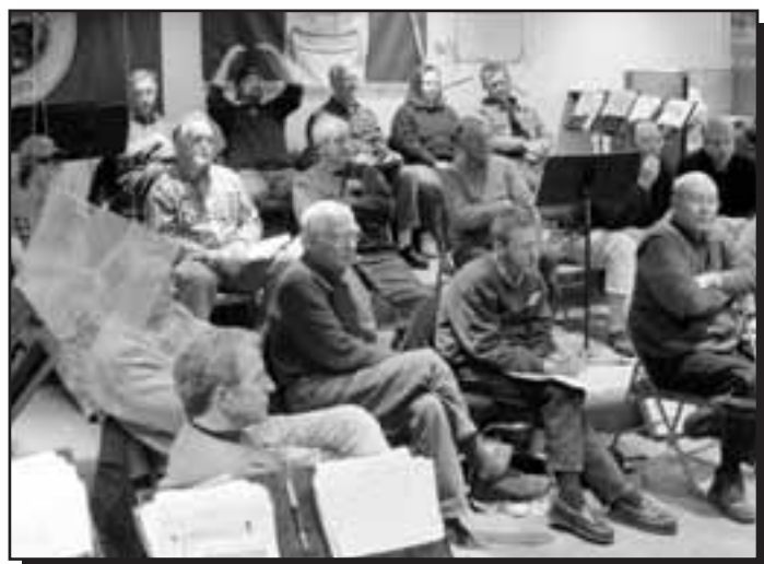
Meeting January 18, 2005, 37 members in attendance.