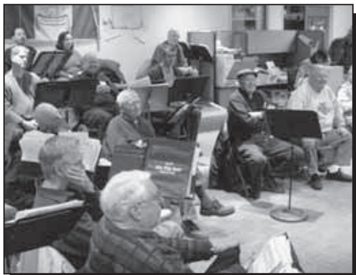
Meeting February 15, 2005, 38 members in attendance.