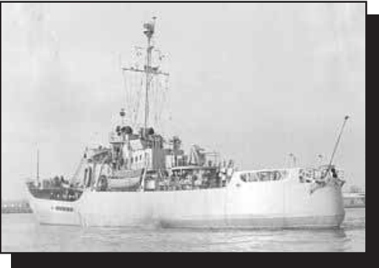
The USCGC Mesquite