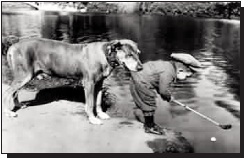
Old Photo - "A Day At The Pond"

Spot putty from automobile stores works great dings, dints and scratches. Goop stays sticky/in some cases can work better