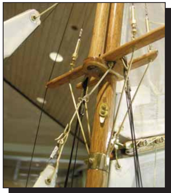
Paul's boat "Patricia" - Bottom 3 photos taken by Al Bickford