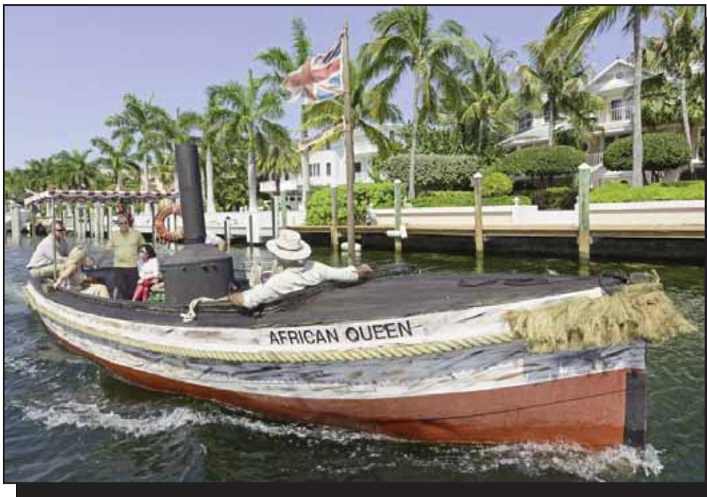
The African Queen, now fully restored and ready for excursions

The African Queen, the historic vessel from Humphrey Bogart's only Oscar winning performance, has been resurrected and restored by a movie-loving Florida couple. The 100-year-old steam boat, named