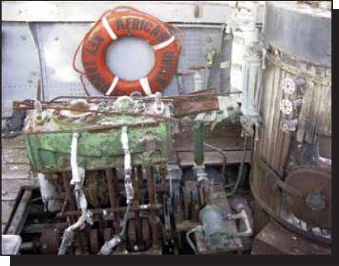
The original boiler had to be replaced