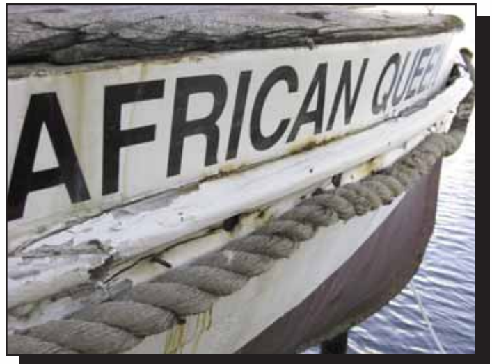
The hull was repaired and reinforced

she was used to transport a mixture of big game hunters, mercenaries and cargo.