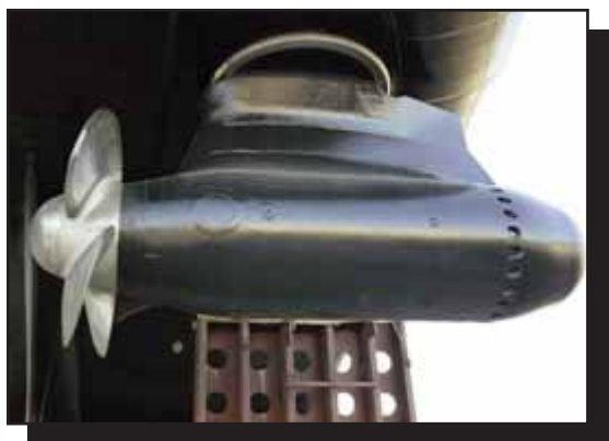
Electric Azimuth Thruster - Azipod