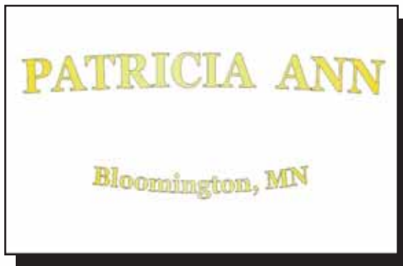
Custom Label by Bedlam Creations

black-and-white is less. All sizes are available, from decals for small models to decals for bikes, motorcycles, cars and trucks. See the website for more info: http://www.bedlamcreations.com/index2.htm