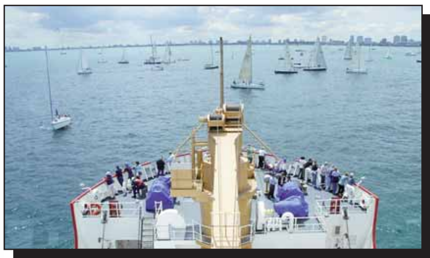
The Mackinaw , at the starting line of the 101st Chicago Yacht Club Race to Mackinac Island on Saturday, July 18, 2009. The Mackinaw shepherds the racers the length of Lake Michigan.

exceptionally maneuverable. Azipods also remove the need for a traditional rudder, as the thrusters can turn 360 degrees around their vertical axis to