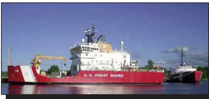
New and old Mackinaws at the Millard D. Olds Memorial Mooring on Lake Huron in Cheboygan, Michigan