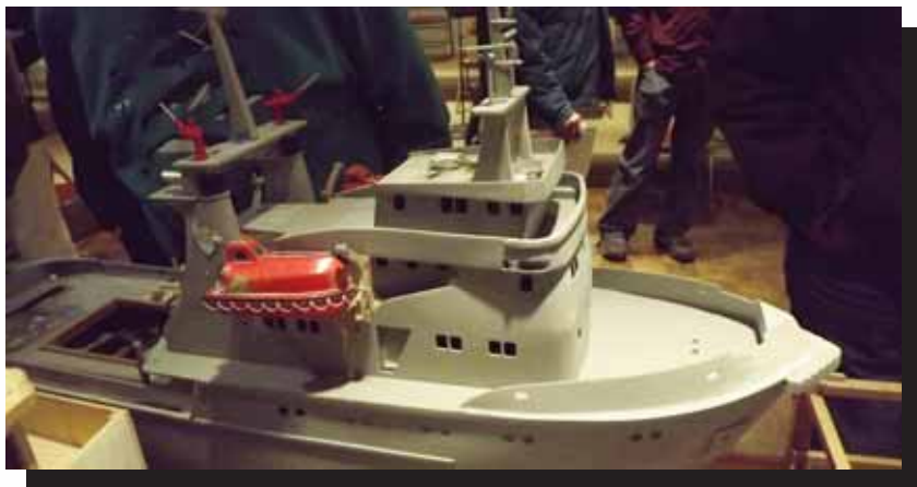
EMYC member Dwight Gronlund's newest creation