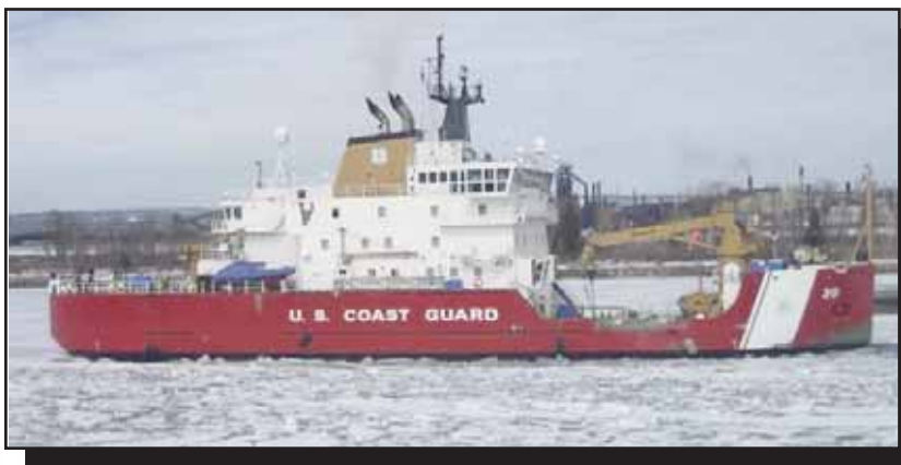
Mackinaw in St. Mary's River approaching the Soo Locks