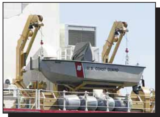
1 of 2 utility boats aboard the Mackinaw