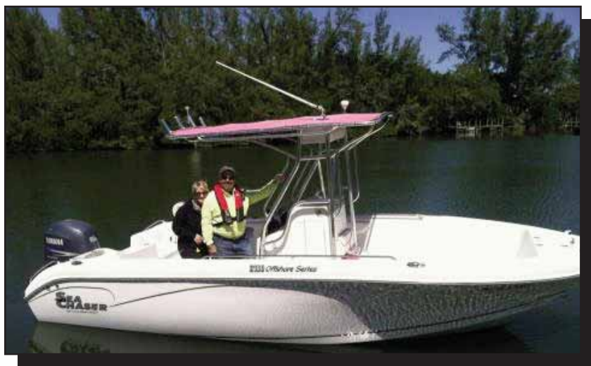
EMYC member Tim Smalley's new boat - Spectrum Radio controller sold separately

black-and-white is less. All sizes are available, from decals for small models to decals for bikes, motorcycles, cars and trucks. See the website for more info: http://www.bedlamcreations.com/index2.htm