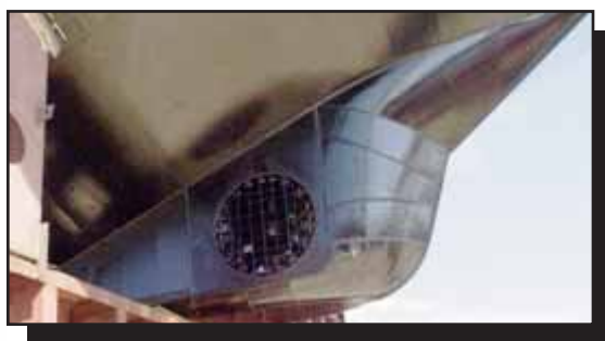
550 hp bow thruster

Mackinaw can cut through up to 10 feet of ice. A unique feature is the ability to pump air from the bow under the ice to raise and crack the ice sheet. Other features include two 50-caliber machine guns, oil spill recovery equipment and full buoy tending capability.