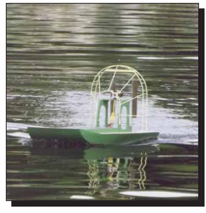
Larry Wheeler's airboat