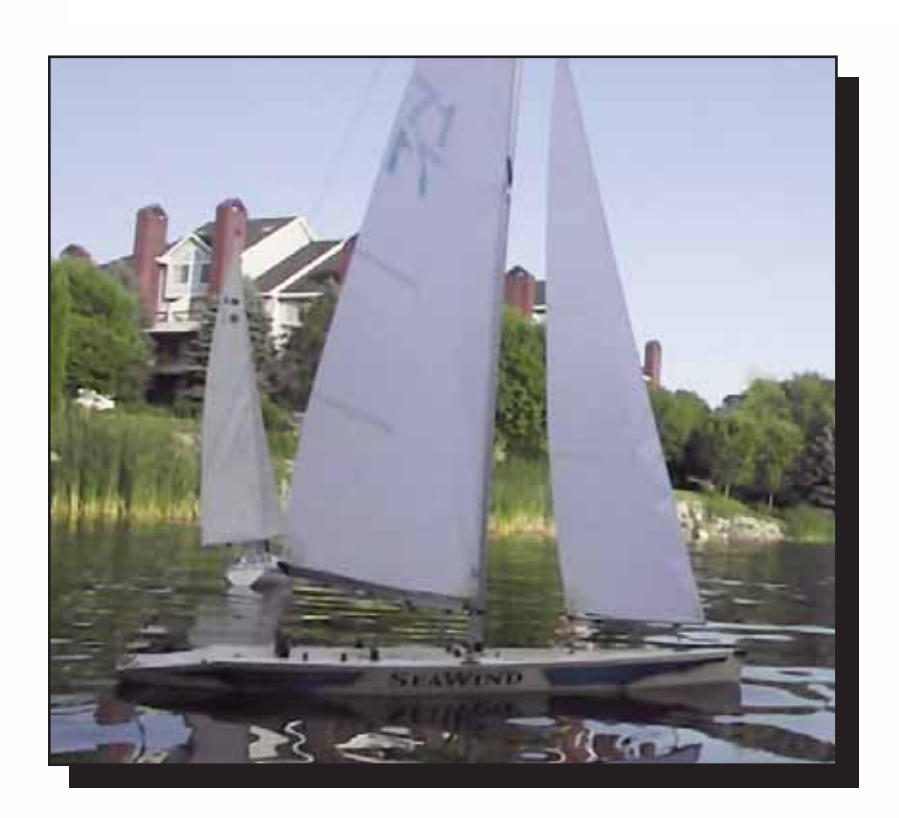
A Seawind sailboat from Fred Ferris' fleet of boats