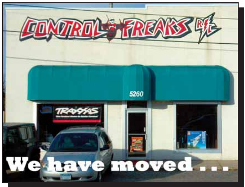
Location: 5260 Independence St. - Maple Plain, Minn