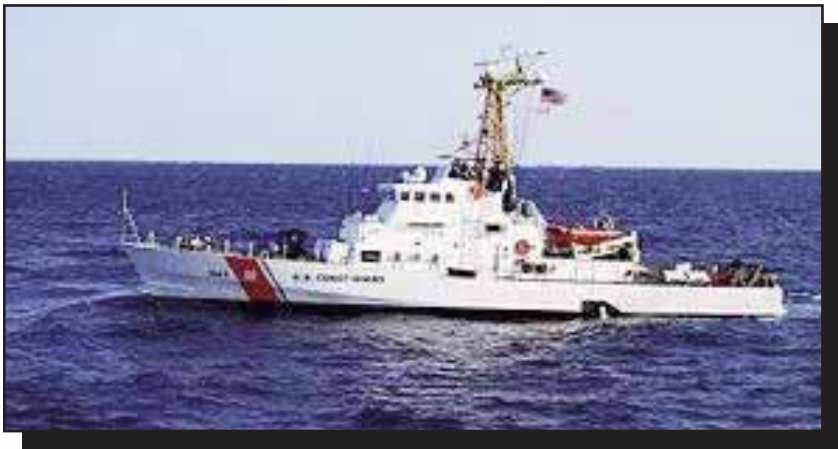
Island class cutter

The Damen Group shipbuilders are based in the Netherlands and have managed the building of Damen Stan patrol vessels for South Africa and the United States. These vessels are designed for high speed coastal patrols and they can be readily adapted to fit many roles. Her hull is steel and her superstructure is aluminum. The 4708 has a length of 153' 7", a beam of 26' 7", and a draught (waterline to keel) of 13' 1". She has a listed speed of 17 mph. One of the interesting features of this ship is an extended bow that gives it more fore and aft stability in the rougher