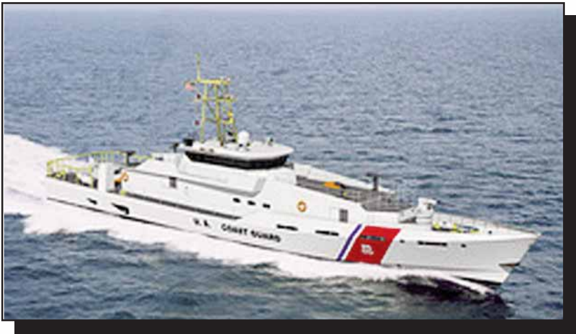
Sentinel Class Fast Response Cutter