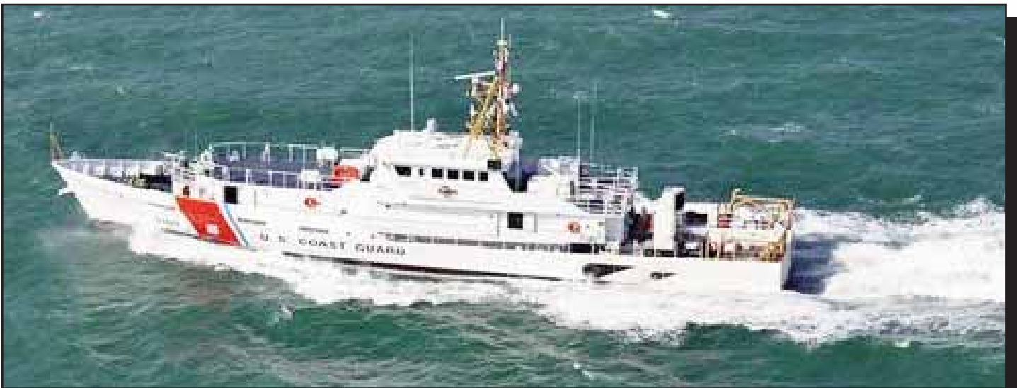
Sentinel class cutter Bernard C. Webber WPS-1101