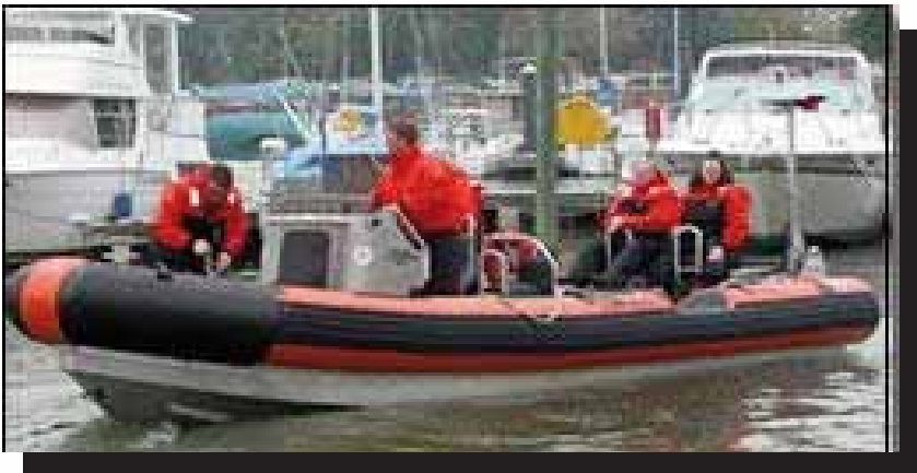
SRP (Short Range Prosecutor)

prototype of the Sentinel Class FRP. This led to contracts for many, if not all, of the planned 58 ships. They are being built in the Bolinger Lockport, LA facility.