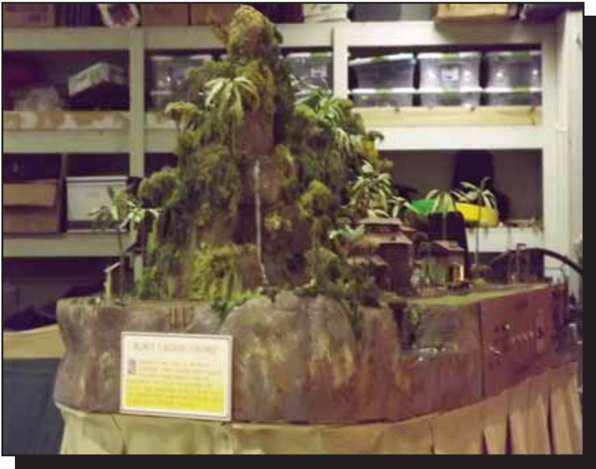
A Banana plantation on a small Caribbean island