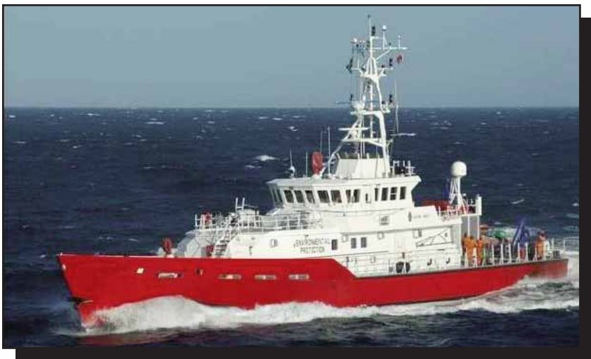
Damon Stan 4708 patrol vessel