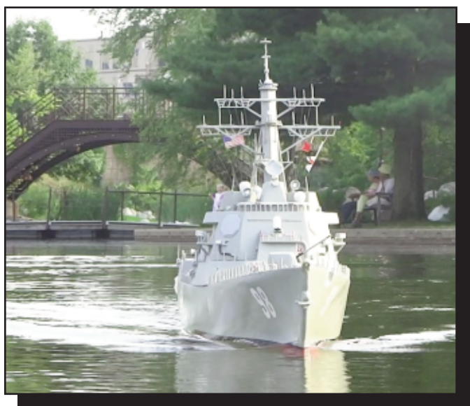
Curt Peterson's destroyer - "Forrest Sherman"