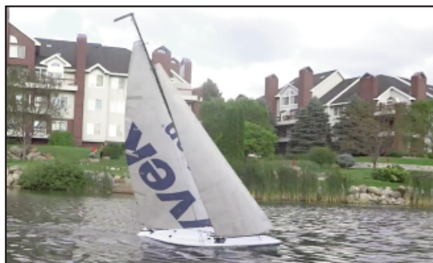
Dennis Bernloehr's scratch built sailboat