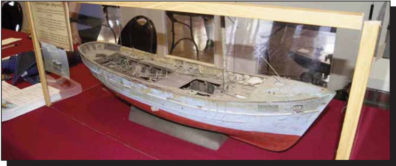
Nordkap Trawler Centennial Lakes Shipwreck on display