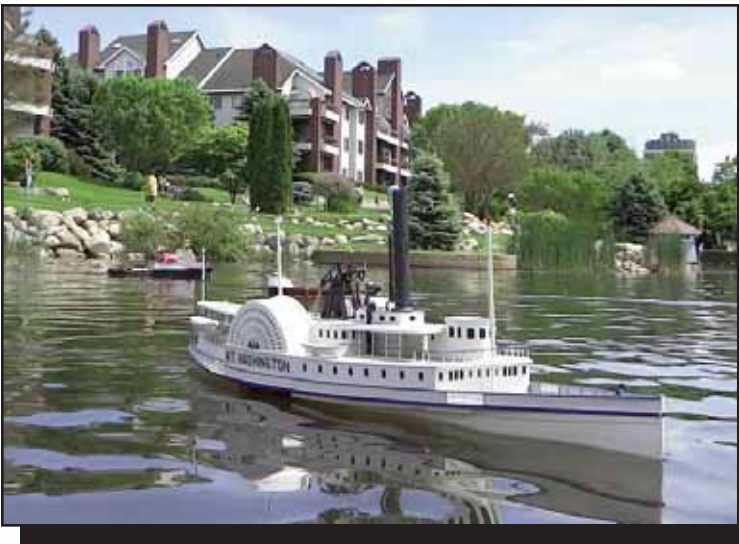
Vern Grimes' Mt. Washington