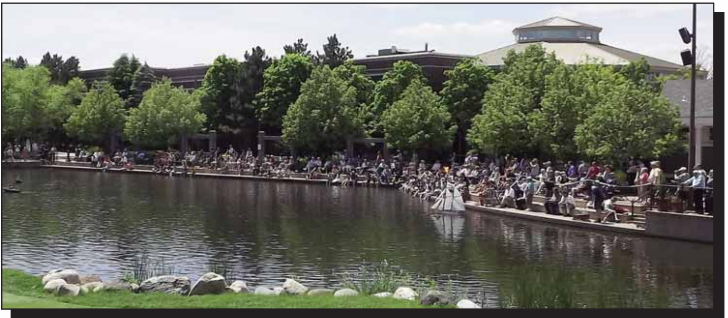
2014 Parade Of Boats

T he 2014 Parade of Boats had everything going for it. Weather was perfect with a light breeze and a great crowd sitting the entire length of the pond behind the Hughes Pavilion at the water's edge. However, there was a severe lack of boats (I counted 57), and only 31 members showed up. C'mon folks, we can do better than that, after all, this is our biggest event of the year and more participation is very important.