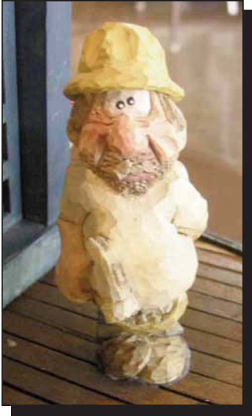
On board the Pilot tugboat