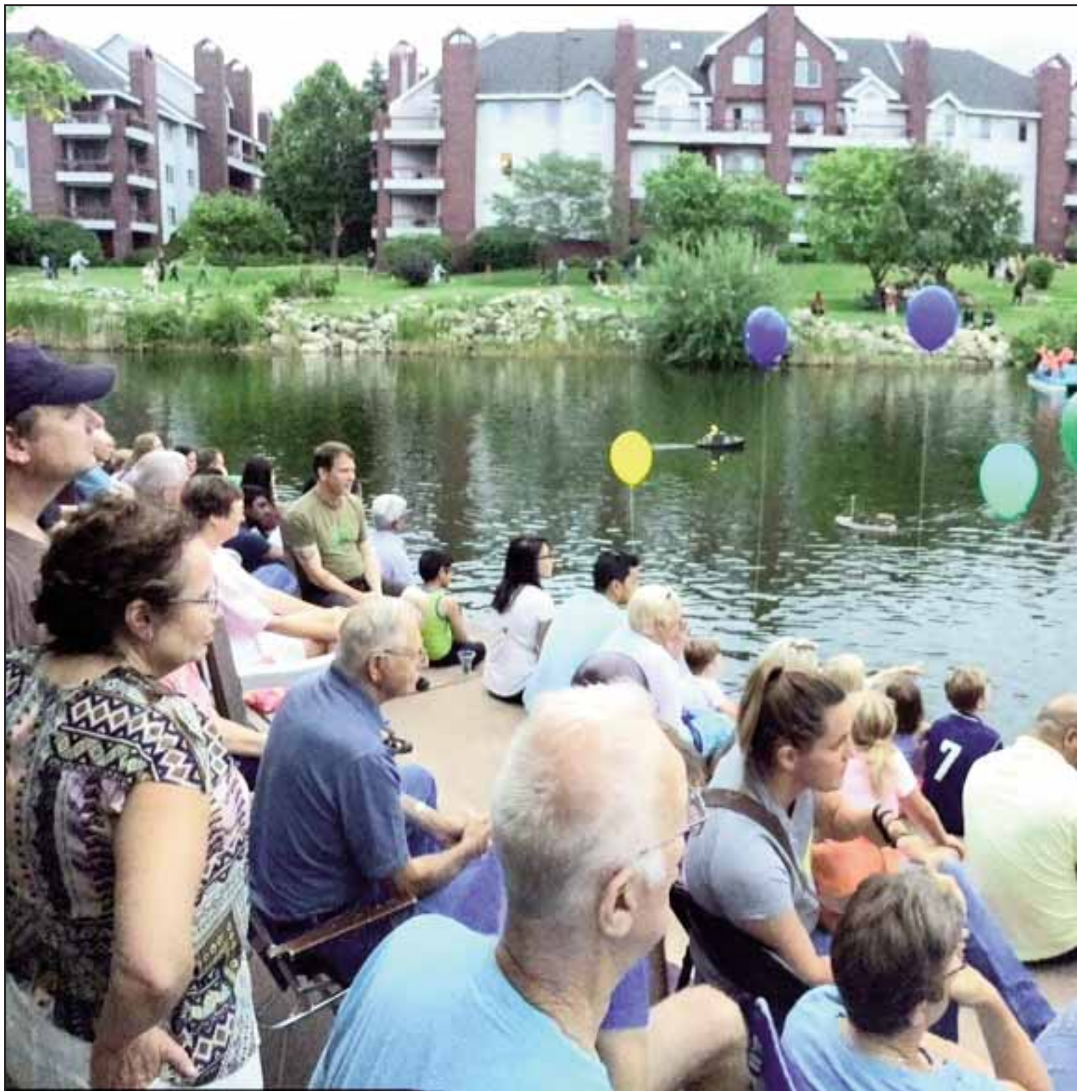
The crowd gathered throughout the evening, both sides of the center pond were full of spectators.