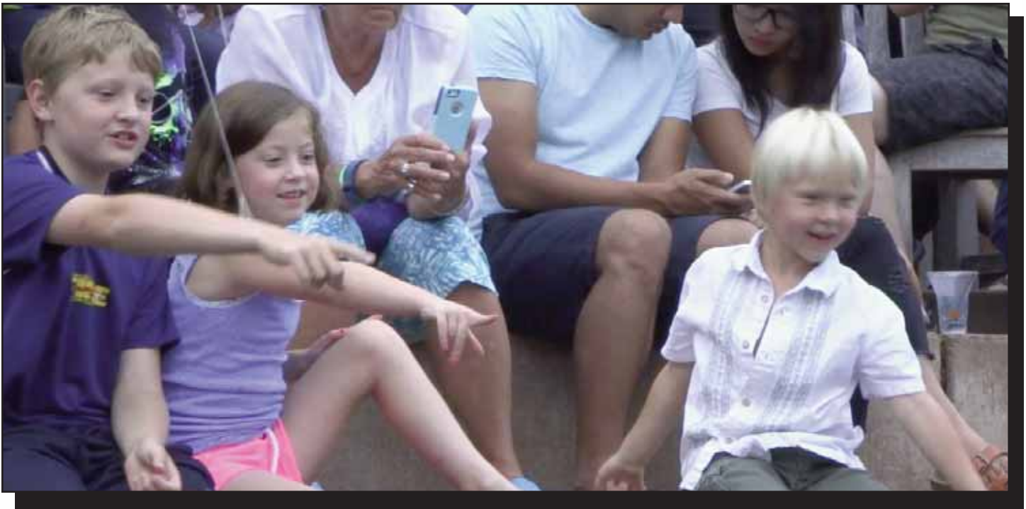
The kid's smiles as the boats go by, says it all for this great event

The 2015 Lighthouse Night had a great crowd along both sides of the center pond and the weather was fantastic! This newsletter is entirely devoted to that evenings photos.