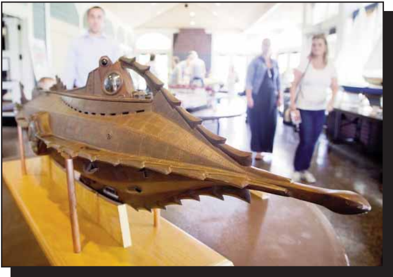
Nautilus Submarine built by Kirk Brust