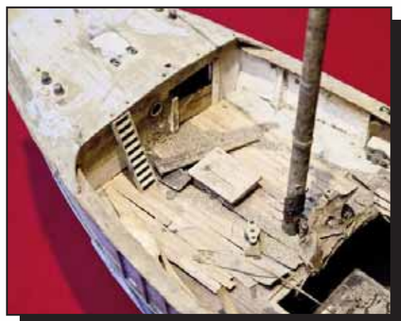
Sink boat for 7 years for "weathering"