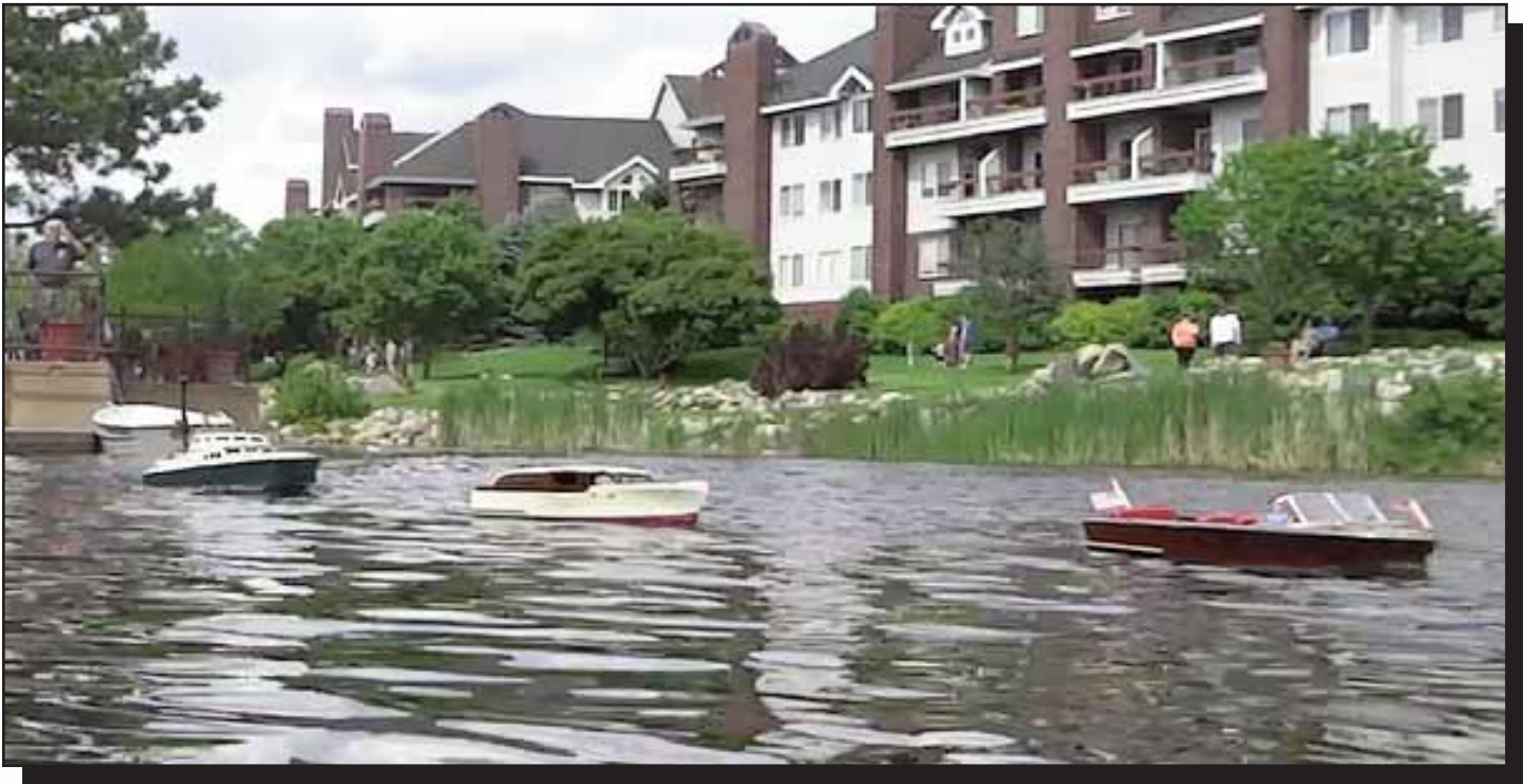
Boat parade at the Parade of Boats