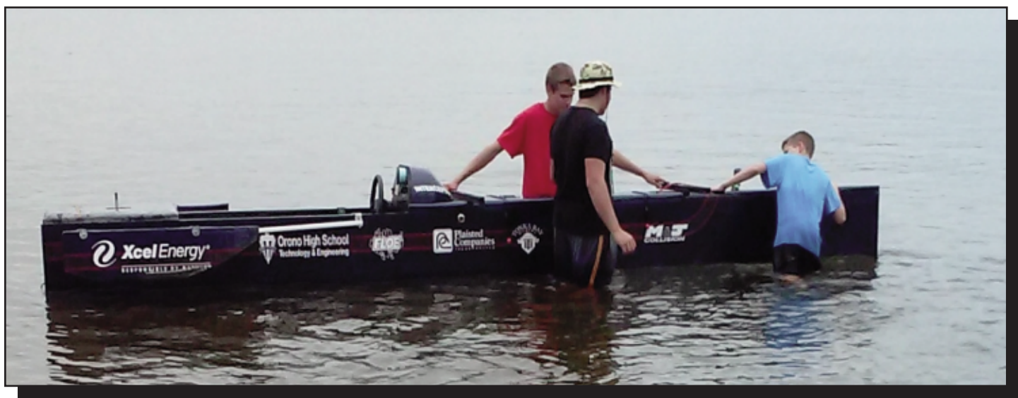
Custom Built Solar Boat