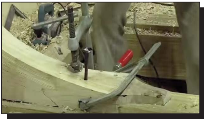
The standing knee is mounted. The toe is clenched to the cross braces with iron nails. Wooden nails are used to fasten the knee to the planking. There are about 10,000 clinker nails in the Draken.