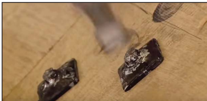
The clinking is done with 100 hammer strokes needed on each nail. This process is why they are called clinker built ships.