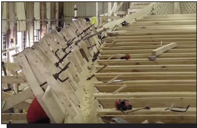
Wood clamps are used to hold the boards together while drilling the pilot holes for the iron nails.