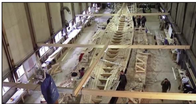
When the 9th strake is in place, the ships bottom is finished. The ribs are attached with wooden nails as they are placed in the ship shown below.