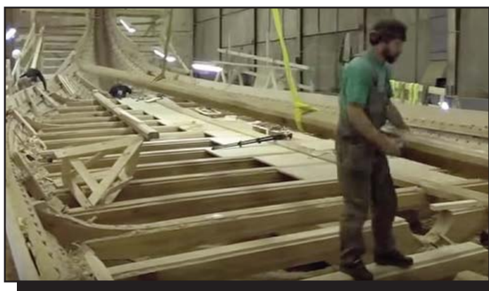
The midship stringers are countersunk over the braces. They give the boat longitudinal strength. The midship stringers are fitted with rabbet joints over the cross braces to lock everything together