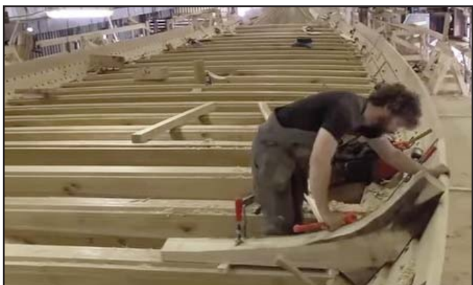
Standing knees must be shaped to the hull, stringer and the cross braces. The stringer is attached to the planking with wood nails