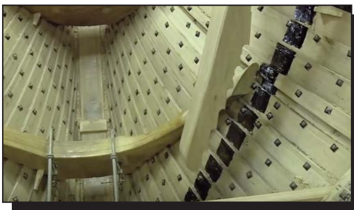
6 standing knees are used in the foreship and reach over the gunwale and become bollards for mooring. 10 boatbuilders worked over 20 months to get to this stage shown below