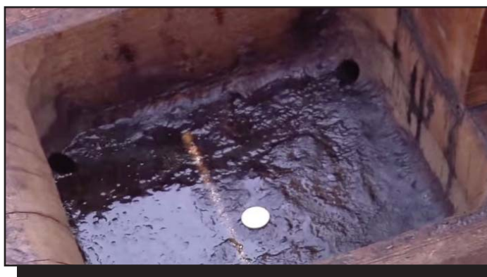
It is a boatbuilders tradition to place a coin under the main mast before the installation of the mast.