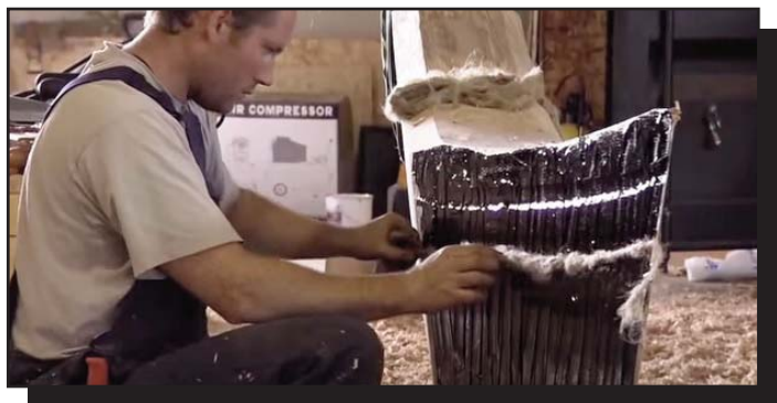
Lubrication of the joints of the two sections of the stern with tar. Hemp is placed as a sealant in a tar joint. This is done in all joints as well as between the overlapping boards in the strakes.