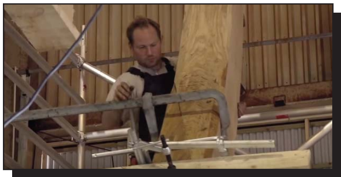
Sections are forced together with large clamps and attached with large iron rivets shown below.