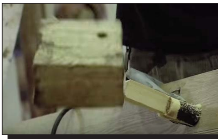
Wedges are driven into the wooden nails