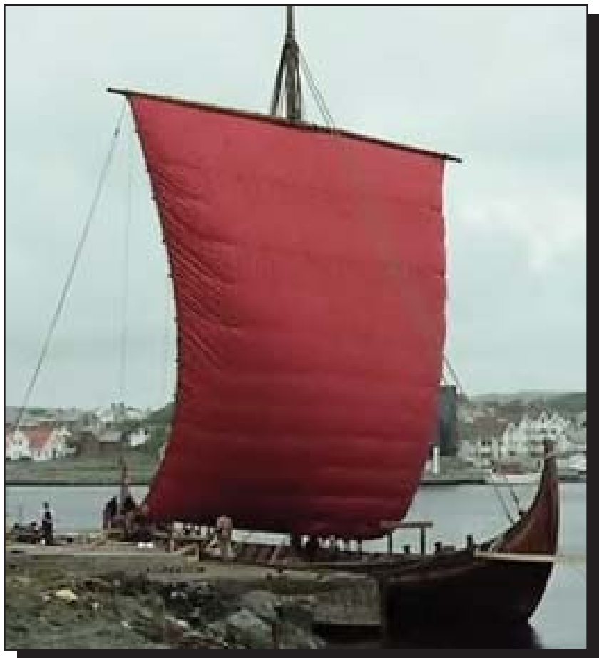
The Draken Harald Hårfagre