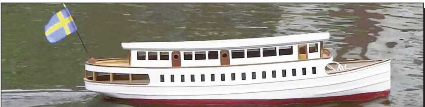
This is an update on the Swedish Ferry project It is almost complete except for the endless details such as: stack, railings, life boat, wheel house (with a troll at the helm) life rings etc. The motor is my favorite "Ax man" purchase. It is an auto seat actuator motor which is what I have in my PT boat, one tugboat and will be used in my aircraft carrier currently under construction. - Bill Uhl