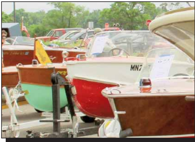
June 25 Time: 10 am - 4 pm White Bear Shopping Center (Lakefront) The club will again display our boats.