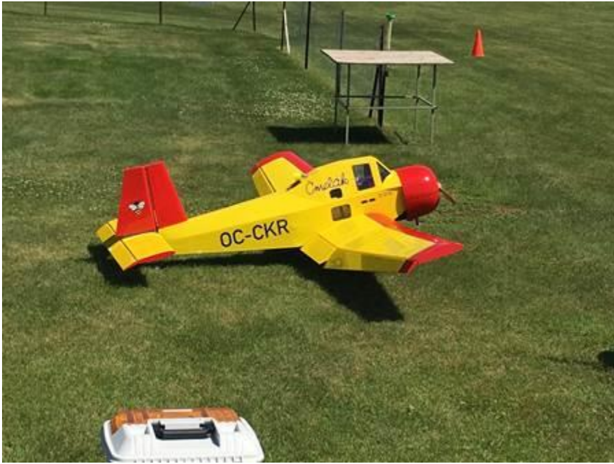
One of the 7 meter sail planes