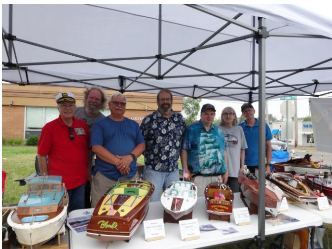
Representing the good 'ol EMYC