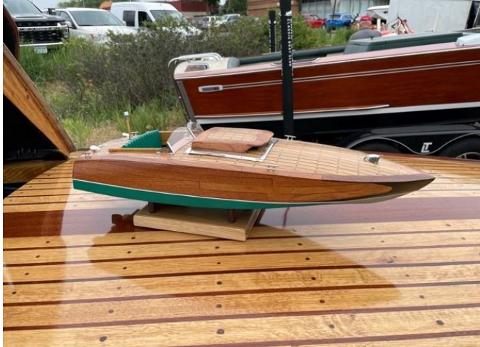
Model of what we hope to have some day