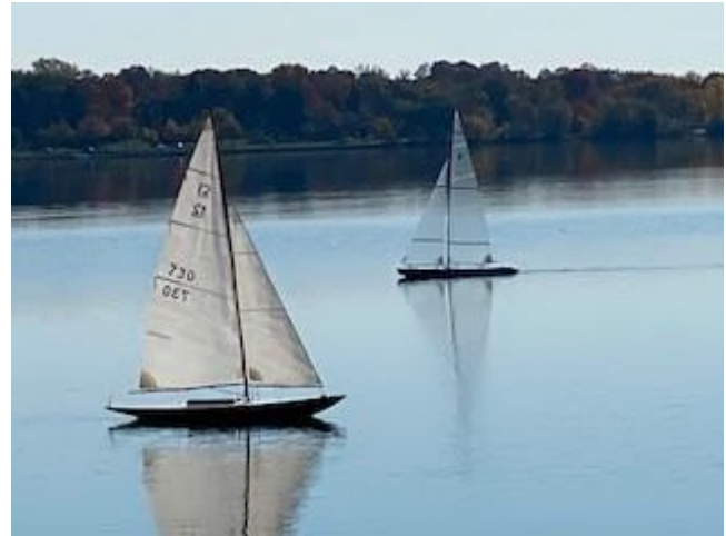
Newport and Mighty Mary