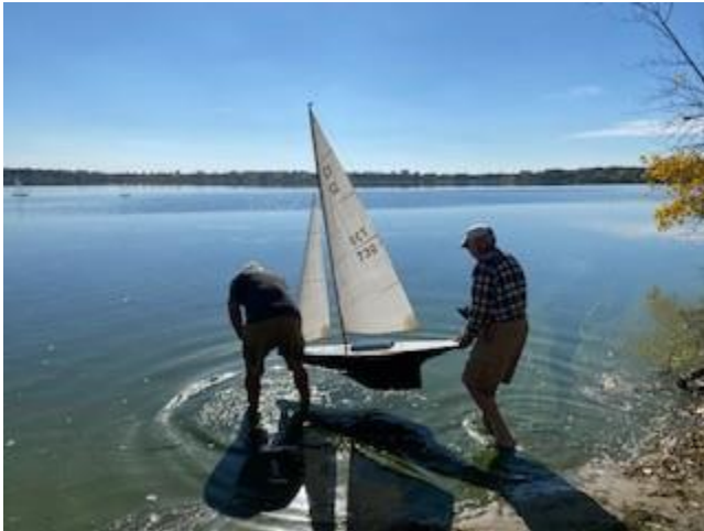
Putting the Newport in the water