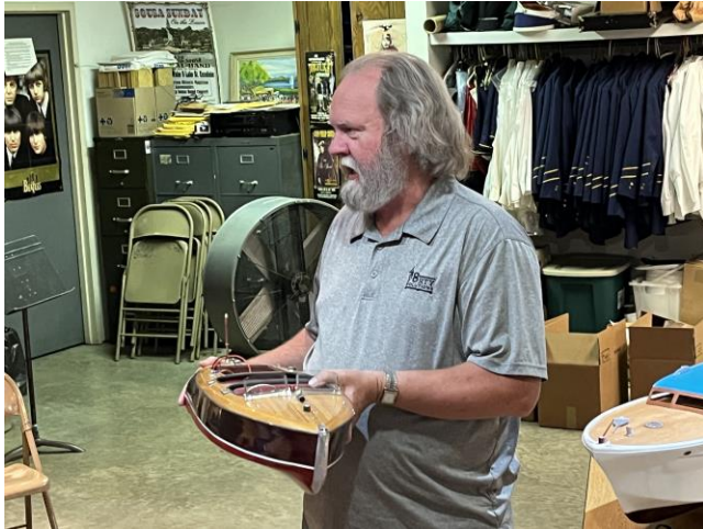
During the formal meeting....

he was having, and the steps he has taken so far to diagnose the problem. There was plenty of lively discussion and advice, and eventually we called a temporary stop to the discussion to be started again after the meeting was adjourned. Remember there are two meetings at the membership meeting. The formal meeting, and the one that takes place after this meeting is concluded. The second meeting takes almost as much time as the formal meeting, just depends on what boats are on the display table.