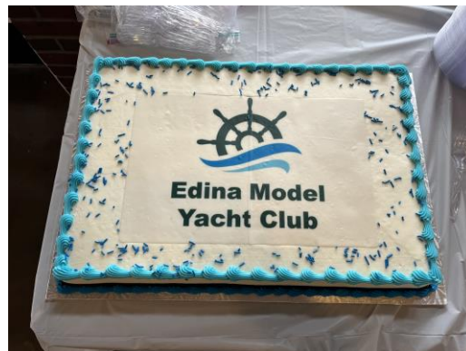
Beautiful cake too!