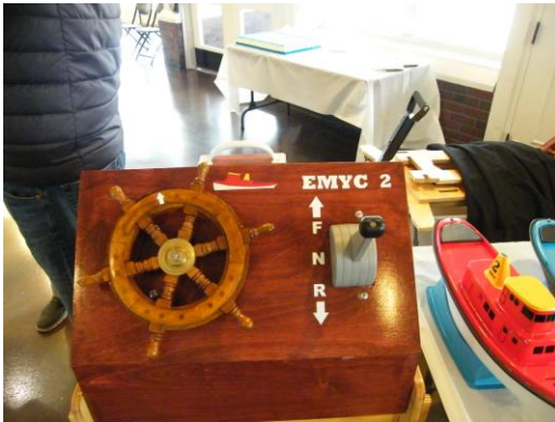
The amazing tug stations