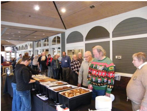
Lineup for great food!