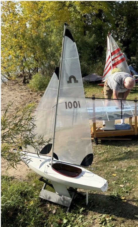
Soling One Meter - one meter/40 inch hull