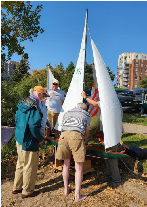
The 'J' getting set up