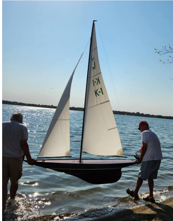
The 'J' going in