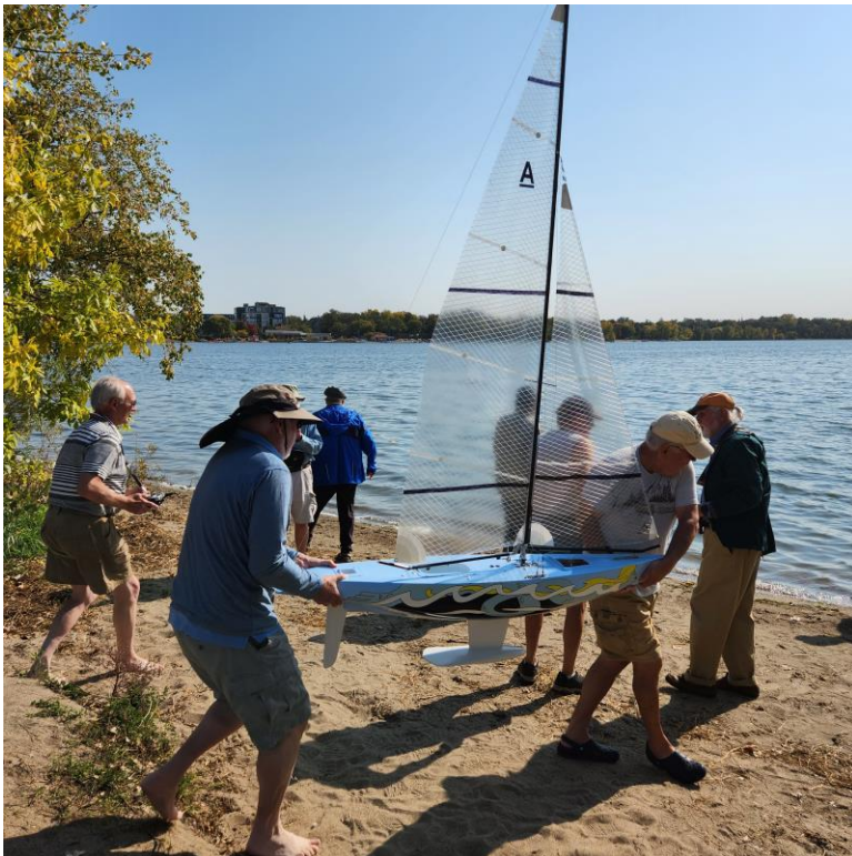
The Mighty Mary, International A Class - 72" hull and 55 pounds, 8 feet of sails.