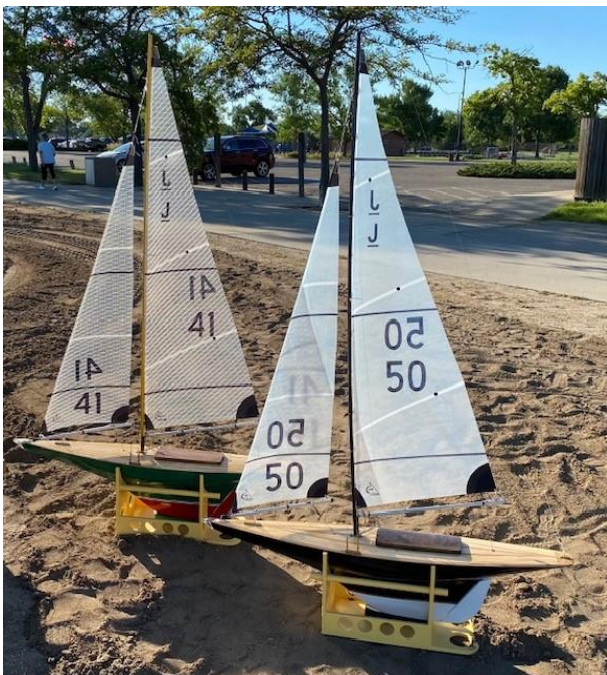
These are 48" hull and 14+ pounds.